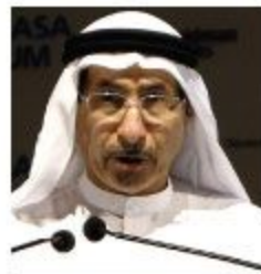
H.E. Sultan Bin Nasser Al Suwaidi Governor, Central Bank of the UAE