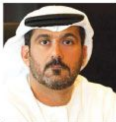
H.E. Hussain Al Hammadi Minister of Education, UAE