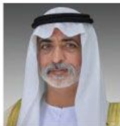
H.H. Sheikh Nahayan Bin Mubarak Al Nahayan Minister of Tolerance and Co-existence, UAE

FOLLOWED BY CONFERENCE PARTY FOR ALL THE GUESTS