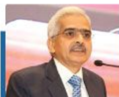
Shri Shaktikanta Das