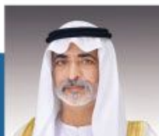
Sheikh Nahyan bin Mubarak Al Nahyan