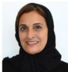
H.E. Sheikh Lubna Bint Khalid Al Qasimi Minister of Economy, UAE