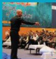
Robin Sharma Canadian writer