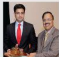
Sachin Pilot former minister Govt of India