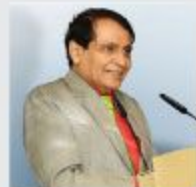
Shri Suresh Prabhu Former Minister of Railways of India