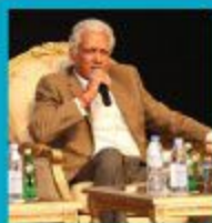
Mohinder Amarnath Indian former cricketer