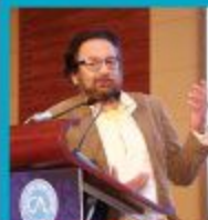
Shekhar Kapur Indian filmmaker

The 35th Annual International Seminar, held at Conrad Hotel, Abu Dhabi Etihad Towers on January 27th and 28th, 2024, featured 10 sessions with 18 speakers under the theme "InnoVision: Empowering Nextgen." Attended by over 800 delegates from the UAE, GCC countries, and India, it marked a significant milestone in the Chapter's history.