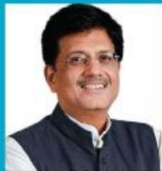
CA Piyush Goyal Minister of State Power, Coal, New and Renewable Energy & Mines, GOI