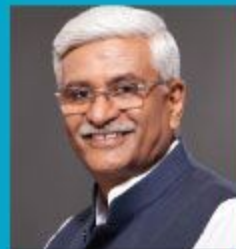
H.E. Gajendra Singh Shekhawat Minister of Jal, Saksh, India