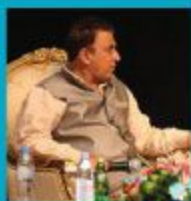
Sunil Gavaskar Indian cricketer