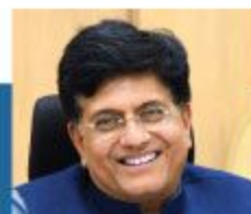
Shri CA Piyush Goyal

Minister of Commerce & Industry, Consumer Affairs & Food & Public Distribution and Textiles