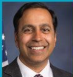
Mr. Raja Krishnamoorthi Congressman - U.S. House Representatives