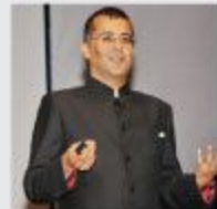
Chetan Bhagat Indian author